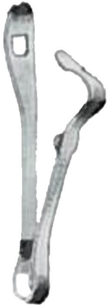
COLLIN UMBILICAL CORD CLAMP OBSTETRIC