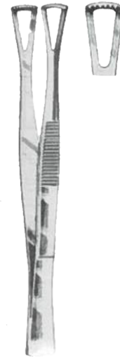
DUVAL TISSUE FORCEP 039-08 14,5 cm