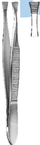
LITTAUER CILIA FORCEP 039-008 8,5 cm