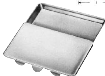
Needle case without perforation 65 x 42 x 8,0 mm (1Pc)