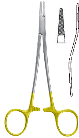
Needleholder 18,0 cm (1Pc) TC-MAYO-HEGAR