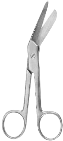
Scissor 14,0 cm (1Pc) BRAUN-STADLER