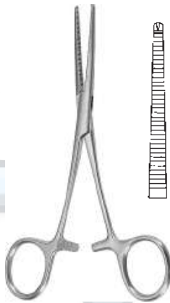
Forceps delicate straight 14,0 cm (1Pc) KOCHER