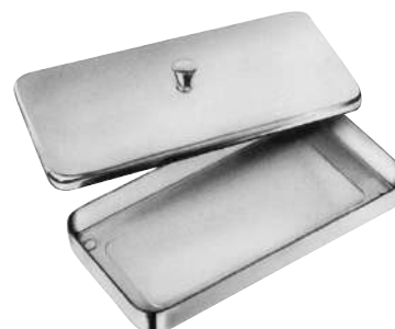
Instrument box with lid with knob 200 x 100 x 50 mm (1Pc)