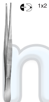
Tissue forcep 1x2 teeth 14,5 cm (1Pc) STANDARD