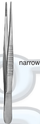
Dressing forcep narrow 14,5 cm (1Pc) STANDARD