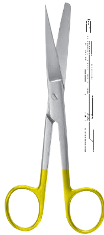
Scissor straight sh/bl 14,5 cm (1Pc) TC-STANDARD